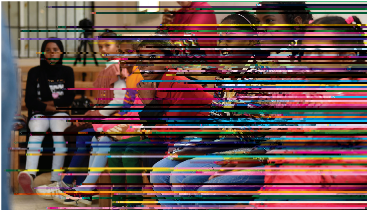
A group of girls attend reading class in Shalateen, Egypt

FGM. A O. FGM GB 1. L GB FGM. R FGM D. FGM GB 2. C FGM GB FGM, E