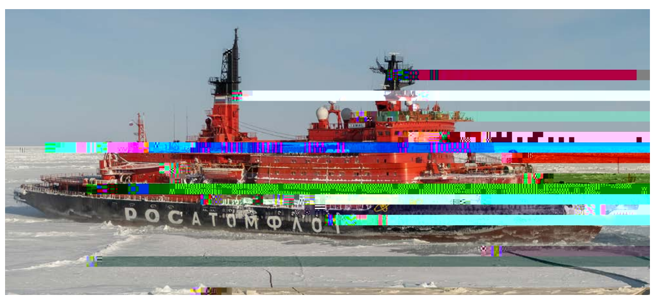
March 22, 2021, Sabetta, Tyumen region, Russia, The Yamal icebreaker moves into ices.

China asserts itself as a "near Arctic state" in order to gain strategic access and influence, though this is not a recognized status. Among the risks posed by climate change is the way it can be leveraged to legitimize access to geo-strategic regions like the Arctic. Part of China's justification is the relevance of Arctic change to their interests, including sea level rise impacts to the Chinese homeland. By this logic, every state in the world could consider themselves to be "near-Arctic states" because of the global impacts of changes in the Arctic. China seeks to strengthen Arctic scientific cooperation which has strong dual-use potential for China's military and intelligence